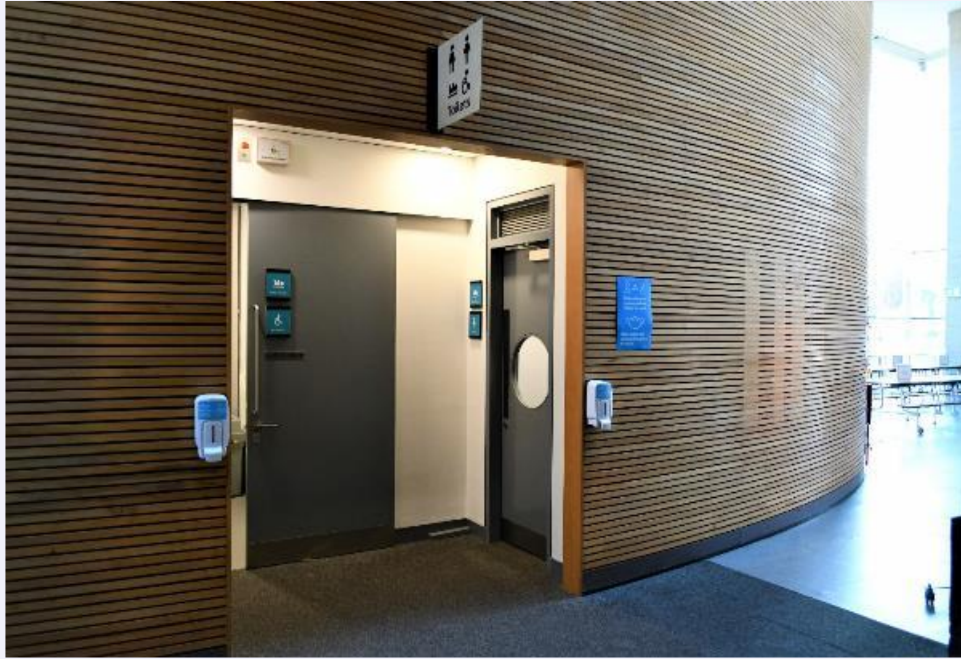
Outside the toilets