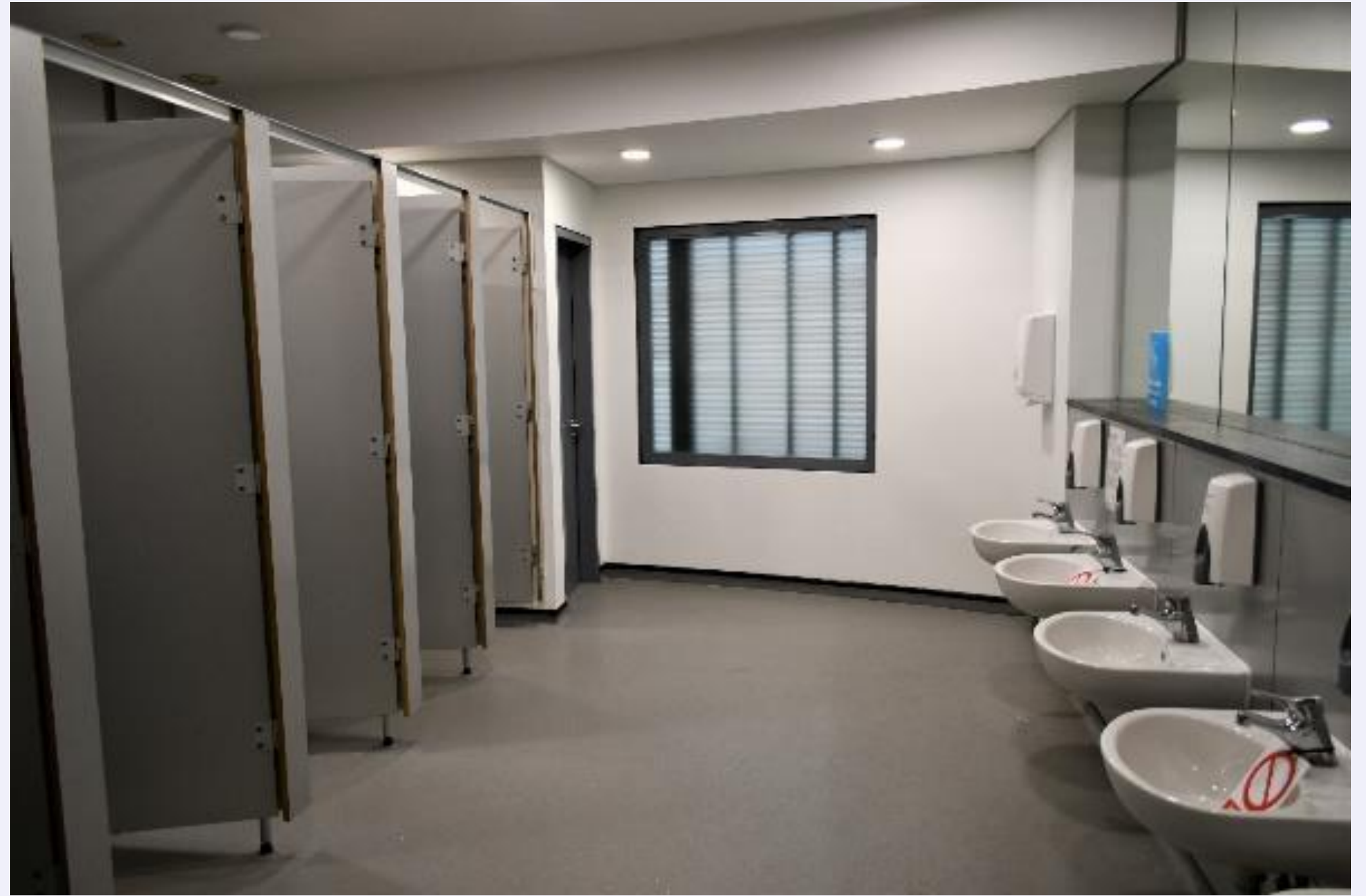
Inside the toilets